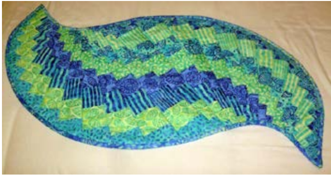
75cm by 40 cm

Suitable for all abilities - a fun quirky and quick project for all.